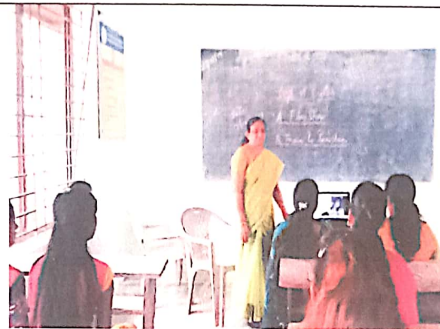
Students watching the movie.