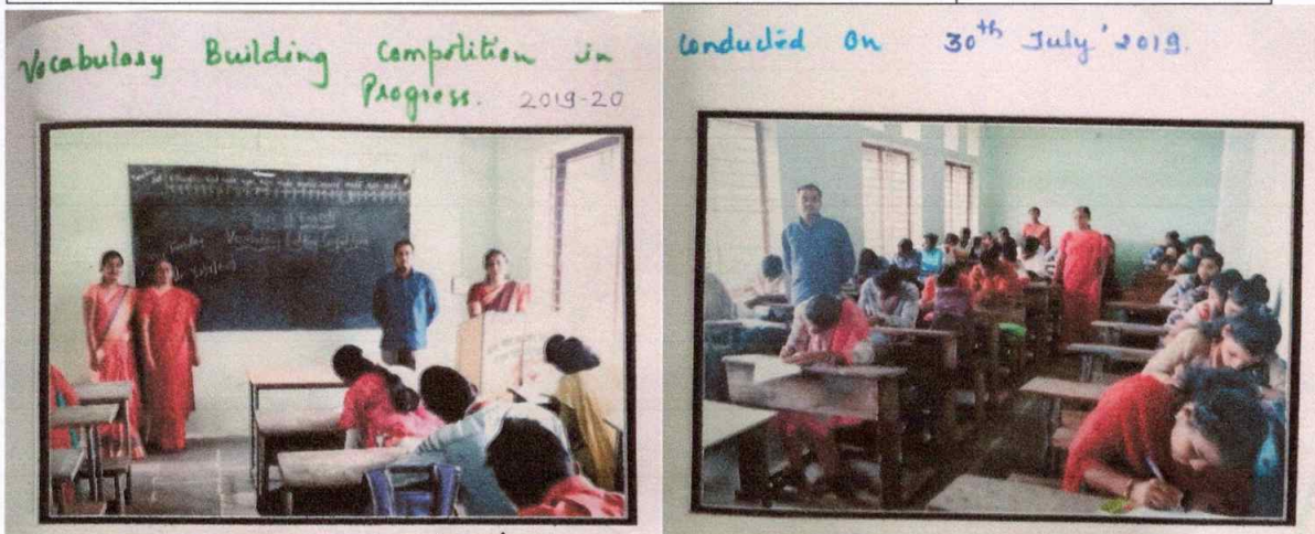
Students involved in vocabulary Building Competition