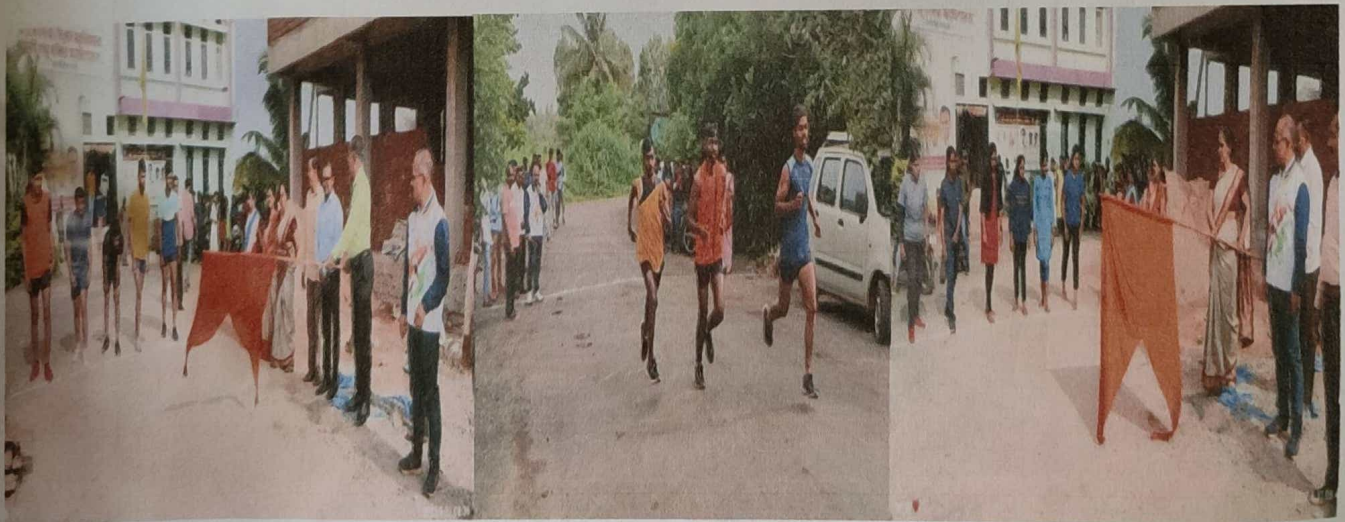
Students Participating in Running