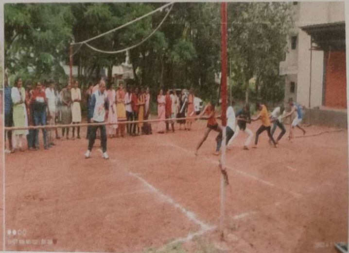
Students playing Tug of War