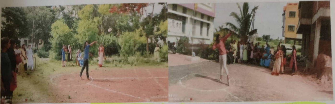
Students Participation In Throwing Competition