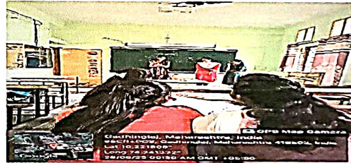
Students group discussing today's marriage practices