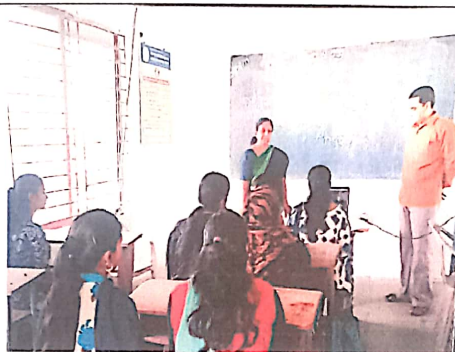
Students watching the movie.