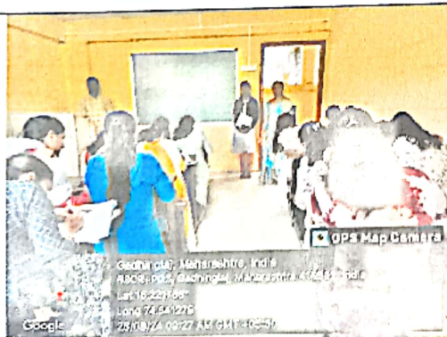
A view of competition