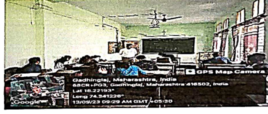
Students of BA Part 1 while writing Marathi proverbs