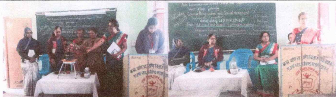
Resource person inaugurating the workshop